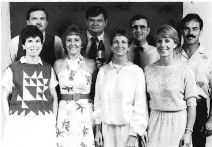
Got a Bewsky on my shoulder!