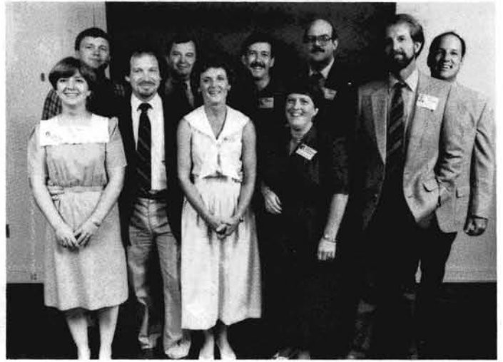
As we go marching!