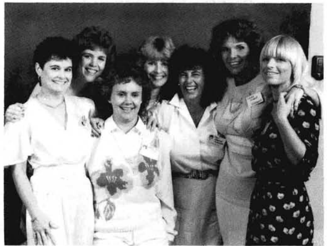
Not too shabby after 20 years!