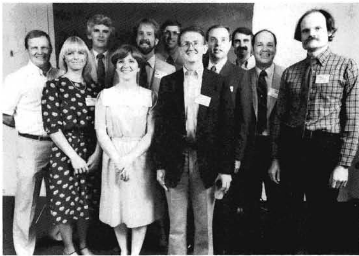
11 on a ticket?