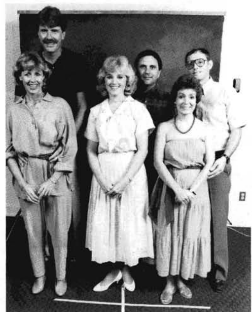
The tall & short of it!