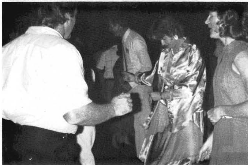
Wow, this is fun