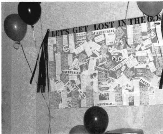
It was great to get lost in the 60's