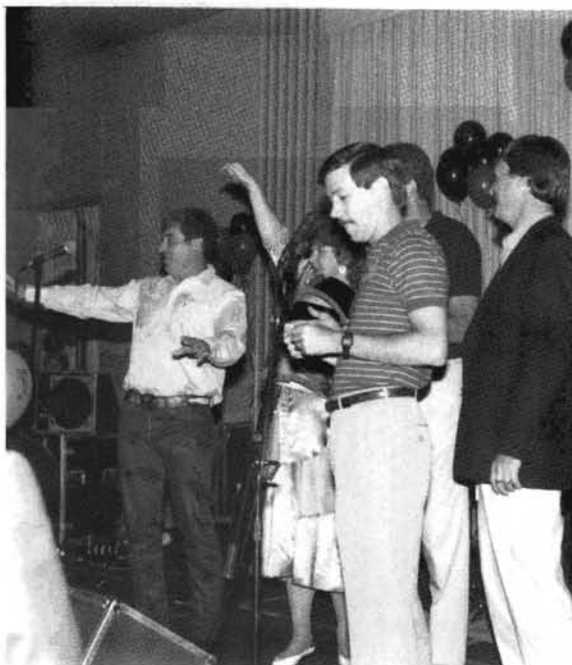
All together now ... 1, 2, 3!