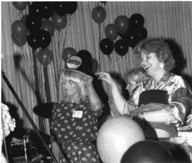
MMM-MMM! Still So Fine