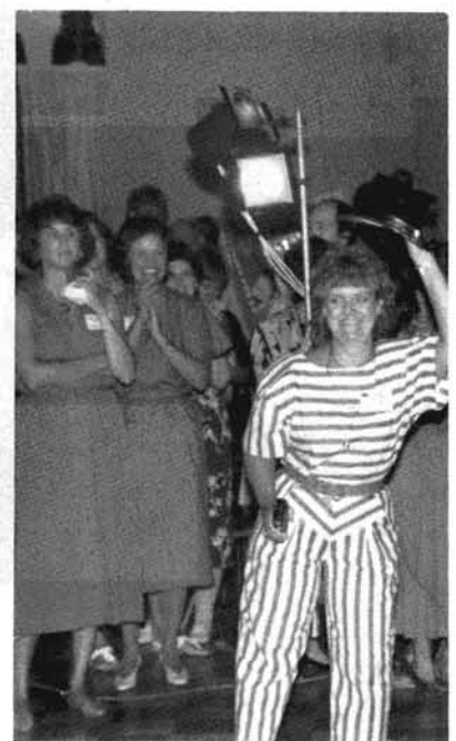
Promise me it's really over!