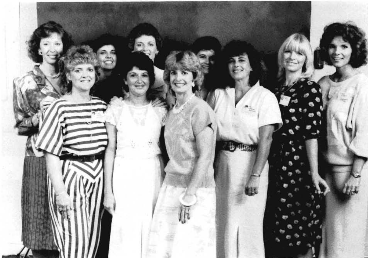
Girls of '66