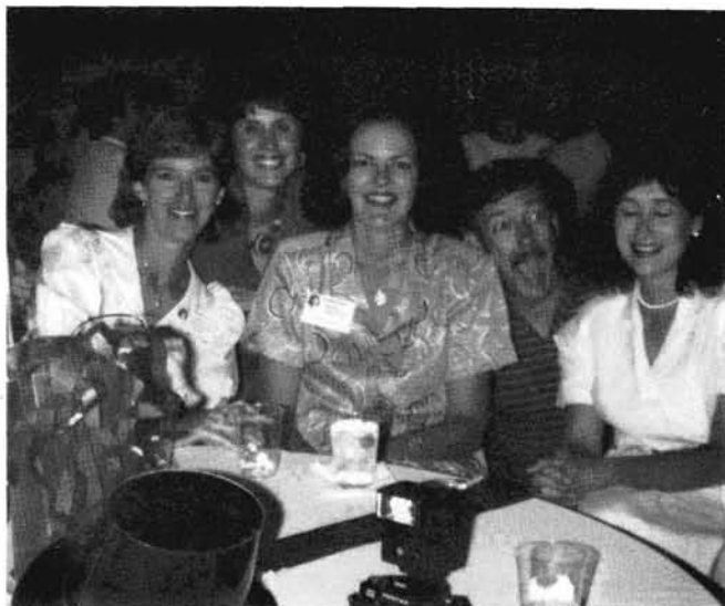
Hey, when you've got it — you got it!