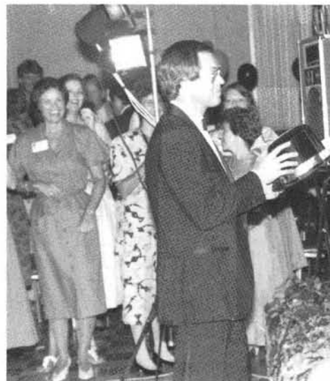
Belle of the Ball