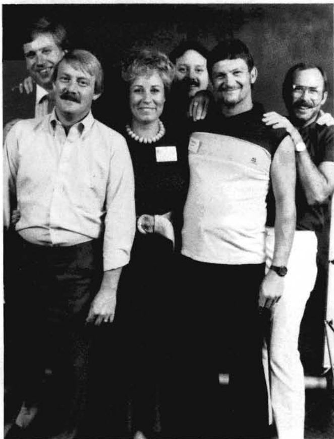
Flight 66 now boarding