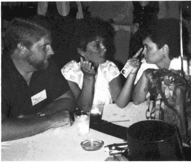
Guess who I saw with who? ! ?