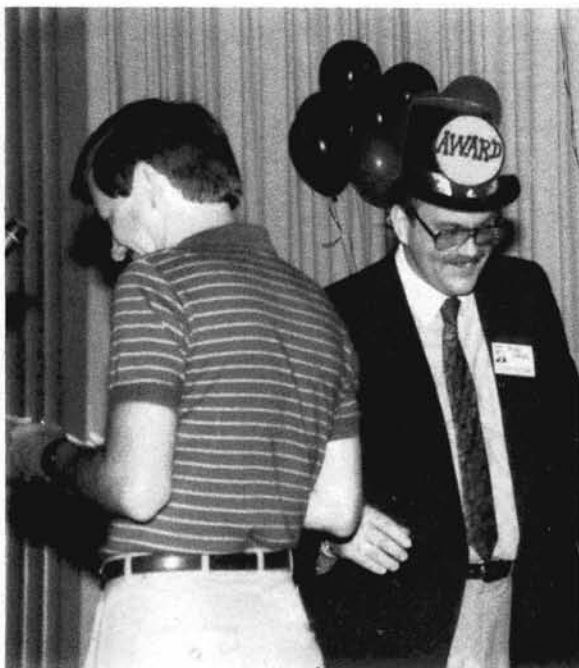
Boy, that was a snap!