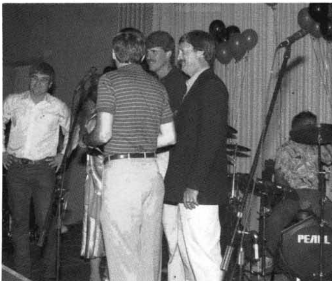
Hey Guys! I'm Still Captain of this Team!