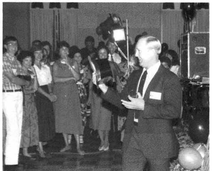
Lt. Col.? Doctor? Lawyer? Thief?