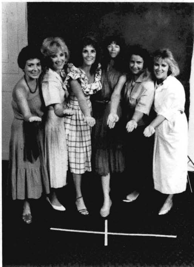
All for Tigers stand up and holler!