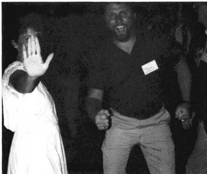
Stop! In the Name of Love!