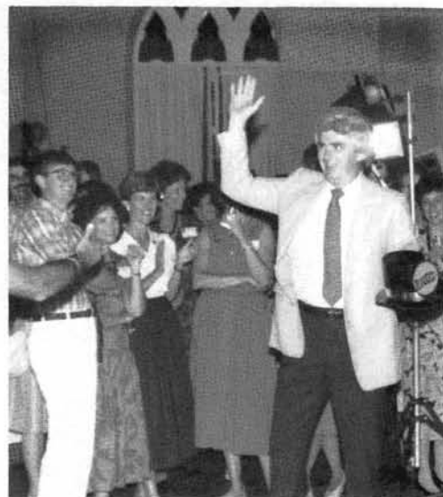
I solemnly swear!