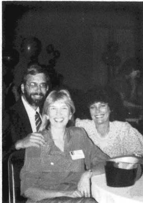
- - You were saying? !