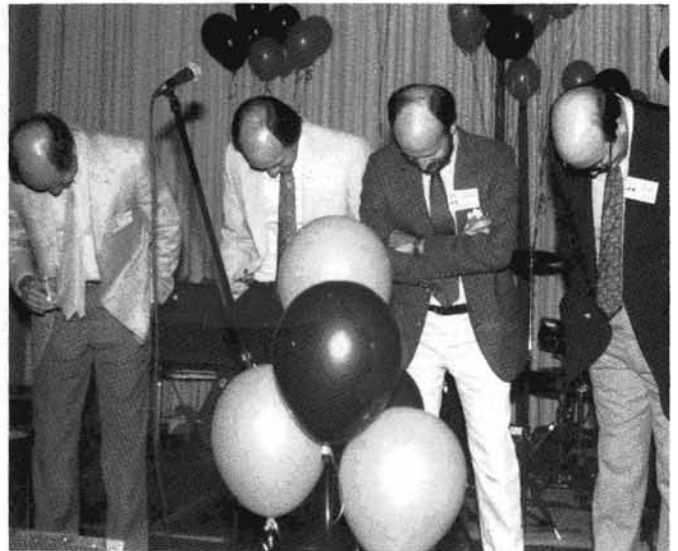
Not Just Your Ordinary Skin Flick!