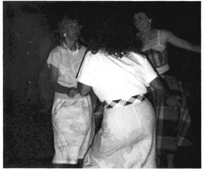
20 years & still Twistin