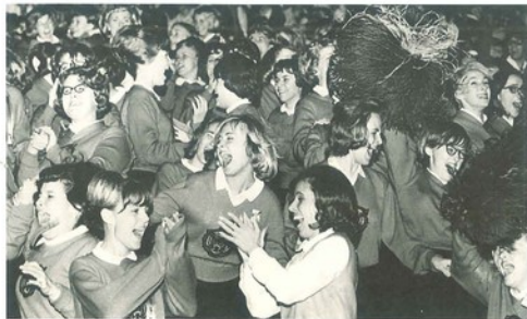
Tiger spirit overflows as the winning point is scored in a great comeback at the Ardmore game.