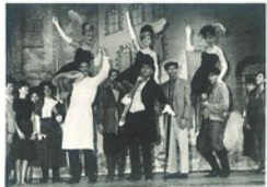
"Wouldn't it be liver-ly." The cast of My Fair Lady pause as the curtain is about to close at the finale of a scene.