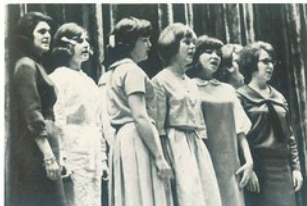
The Sophomore Triple Trio performs in the Christmas Concert.