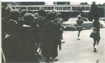
"Tigers on to Victory! Go! Go!" The Gingersnaps march their way to a victorious game with Ada.