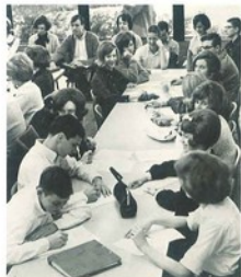
The sophomores cut up at a Student Council meeting.