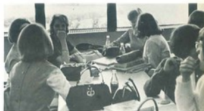
Future Teachers enjoy a coke party given after one of their meetings.