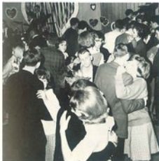
Slowing the bear down a little, the Phis plays for the Non-or-Never Valentine's Dance.