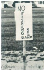
Band members displayed an active concern for the welfare of school property.