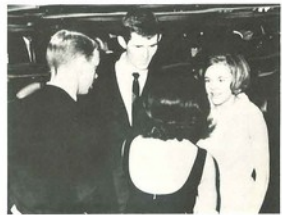
... students enjoyed the Christmas Party.