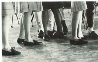
... Weejuns were in style.