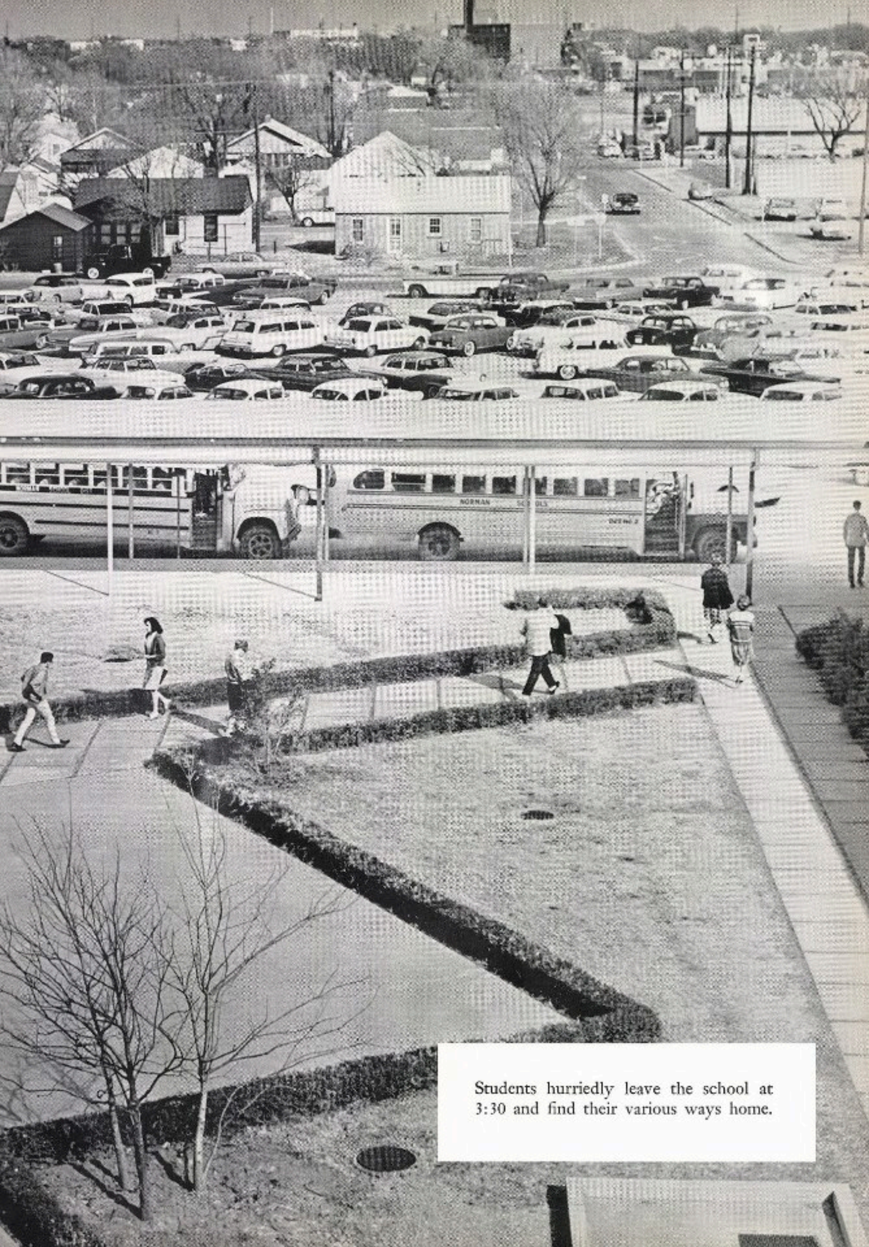
Students hurriedly leave the school at 3:30 and find their various ways home.