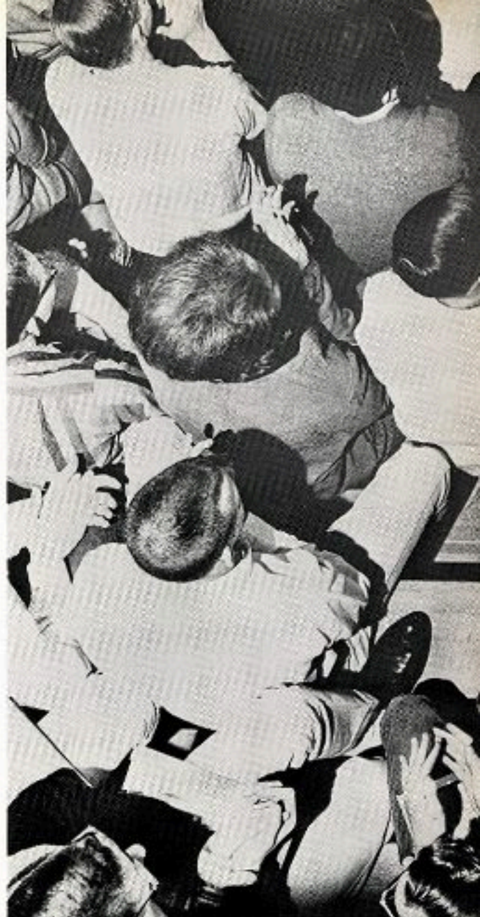
A bird's-eye view of a can of sardines? No, it's our flying photographer's view of the bleachers during an assembly.

The Junior Class presented their Prom, "Camelot," in a bright array of splendor. After the Prom came the end, Graduation. This has been a grand year at NHS and one you as Seniors will cherish as your last, you as Juniors as your breather between two wonderful years, and you as Sophomores as the beginning of your life in the home of the Tigers.