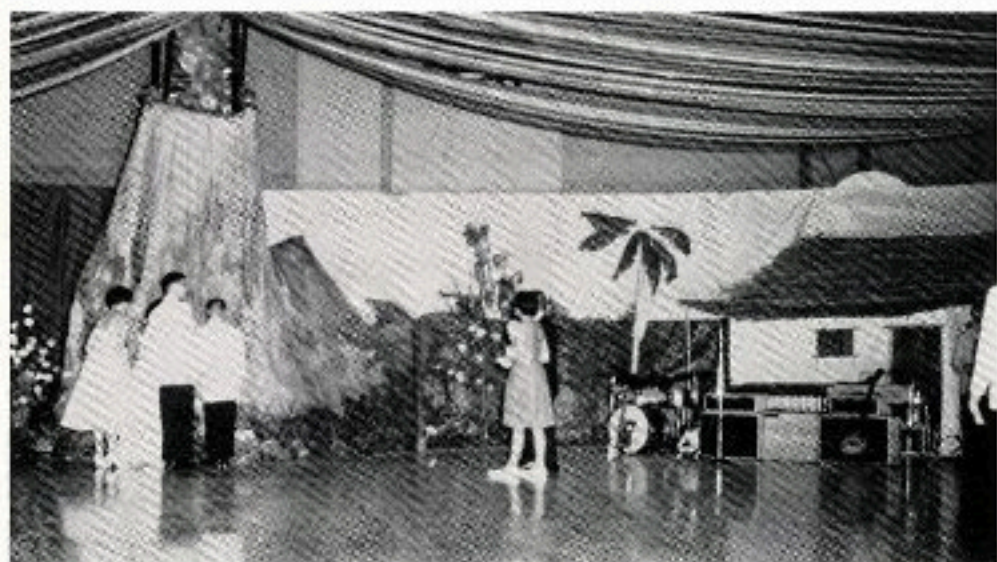
The beautiful decorations of last year's Prom, "Adventures in Paradise," helped to make it a great success.