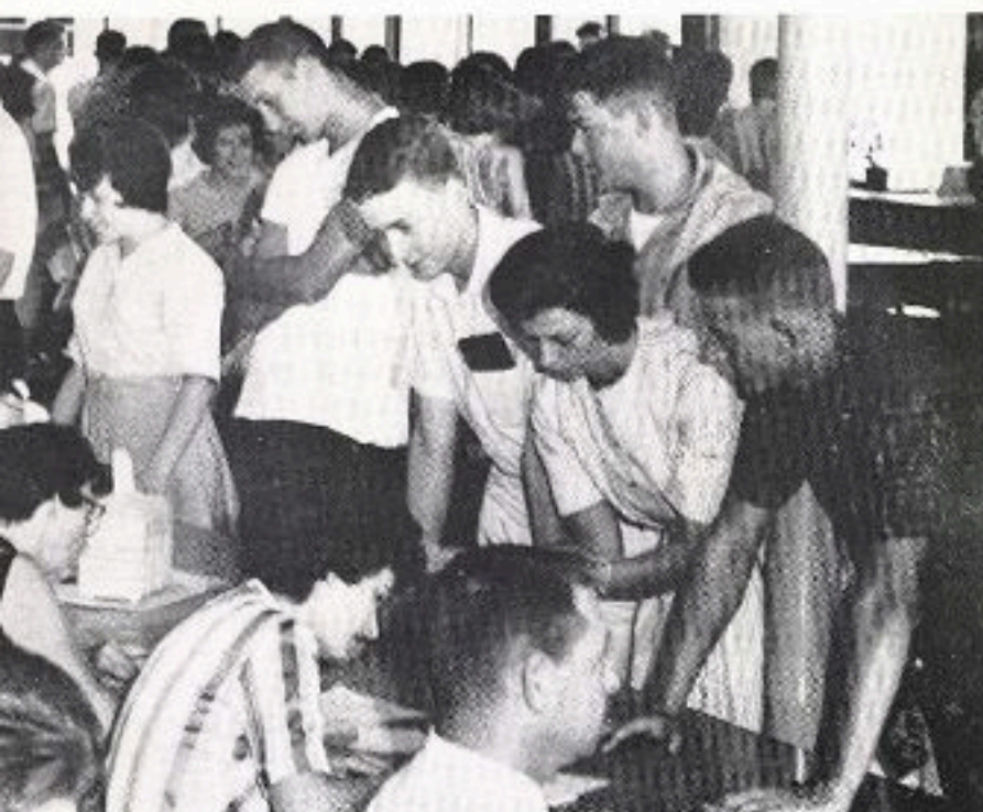
The student center buzzed with excitement during enrollment the last three days of August.